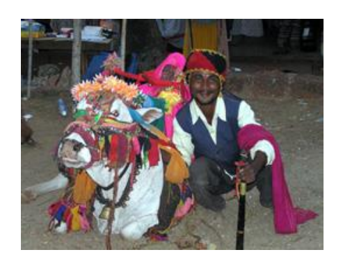
Goa: fortune-telling cow

While I went to a couple of stunning and imaginatively laid out restaurants, the food was nothing special. Perhaps because the peak December season is over, Goa seems tired, sad, flat and a little desperate. The famous Tito's nightclub seemed to be dead - I never saw anyone going in and never came across one of the infamous Goa trance parties that supposedly abound here! Everyone seems to be in bed by 11pm!