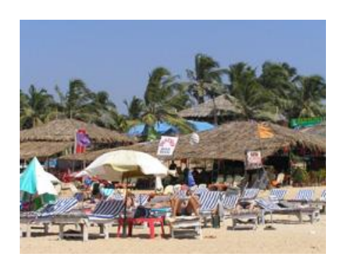
Beach scene Goa (looks a LOT better than it is)

The beach is even worse. At least there is sand, although it is hidden somewhere under endless rows of beach shack bars. Consider a 10km stretch of beach with one shack every 10m. The shacks are temporary structures built of poles, woven palm to form mats and palm or thatch roofing. Under the covered area they have a basic kitchen and tables and chairs for eating. Out front they have beach reclining beds set up under umbrellas. At the most popular locations there are 6-8 rows in front of each shack filled with lolling people - Indian as well as foreign tourists. This overflows out of the shacks where the worst of the world seems to be cooking itself to cancerous red in full sun next to its turf-demarcating umbrella. When you add jet-skis and motorboat joy rides, mainly utilized by the teenage Indian male tourists you can understand my disenchantment.