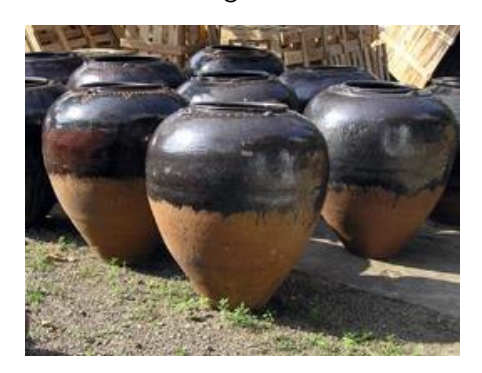
Matovans: Fort Cochin

The oldest part of Fort Cochin is the area known as Jew Town, which dates back to the 1st C AD and which was augmented in the 16th C by a large influx of Jews escaping the Inquisition. This is interesting historically, but is sadly tumbledown and equally full of tourist traps and Kashmiri touts and compared to the rest of India, prices are very high here! I did see some wonderful, huge old matovans but they were way too expensive to bring back for resale.