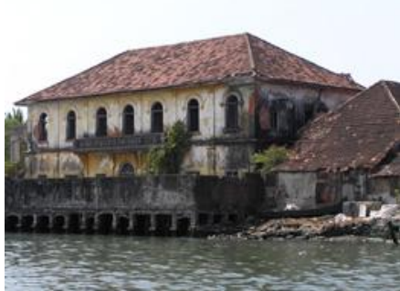
Black pepper warehouse, Fort Cochin